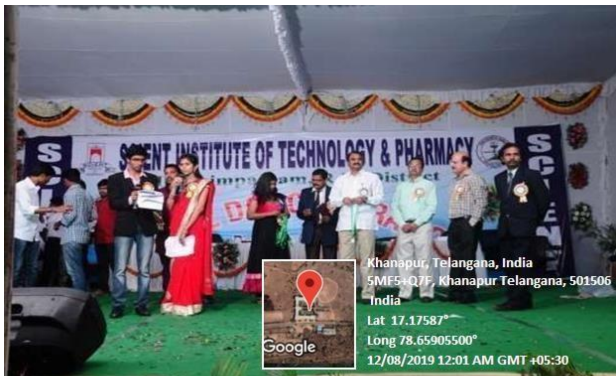
One of the faculty member giving a speech on Youth Day