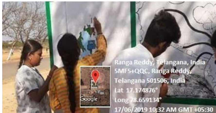
Students participated in the painting competition

This club exists to give the students an artistic outlet and to help enrich and foster an interest for art and personal expression through art. Though the club is for artists, it can be enjoyed by all who appreciate art.