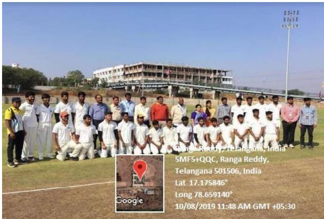
Students from EEE department won the Cricket tournament