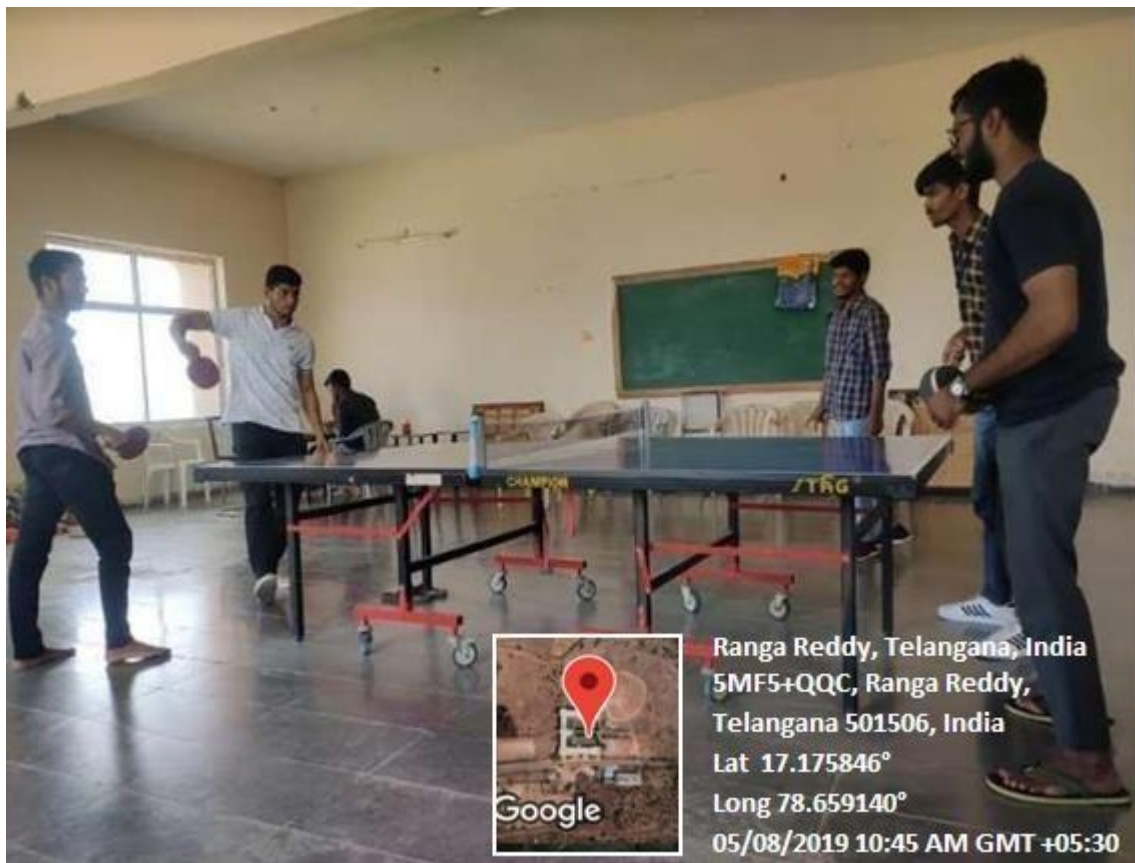
Students playing Table Tennis