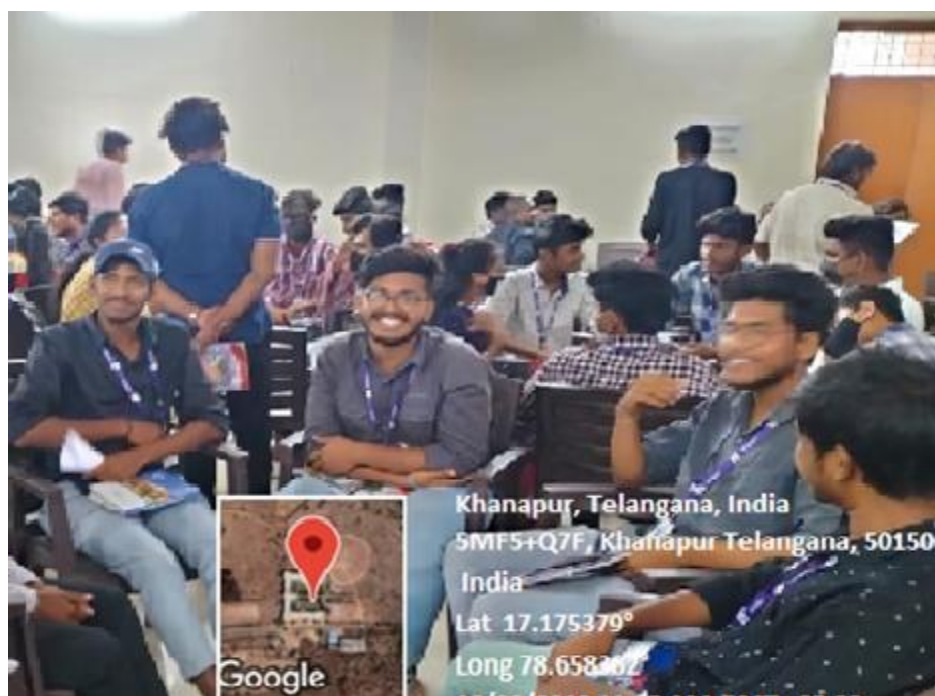
Students actively participated in the Quiz