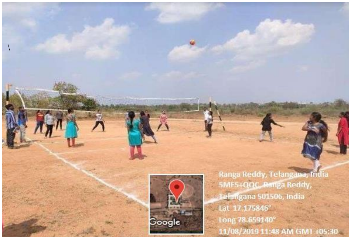
Students playing Volley Ball