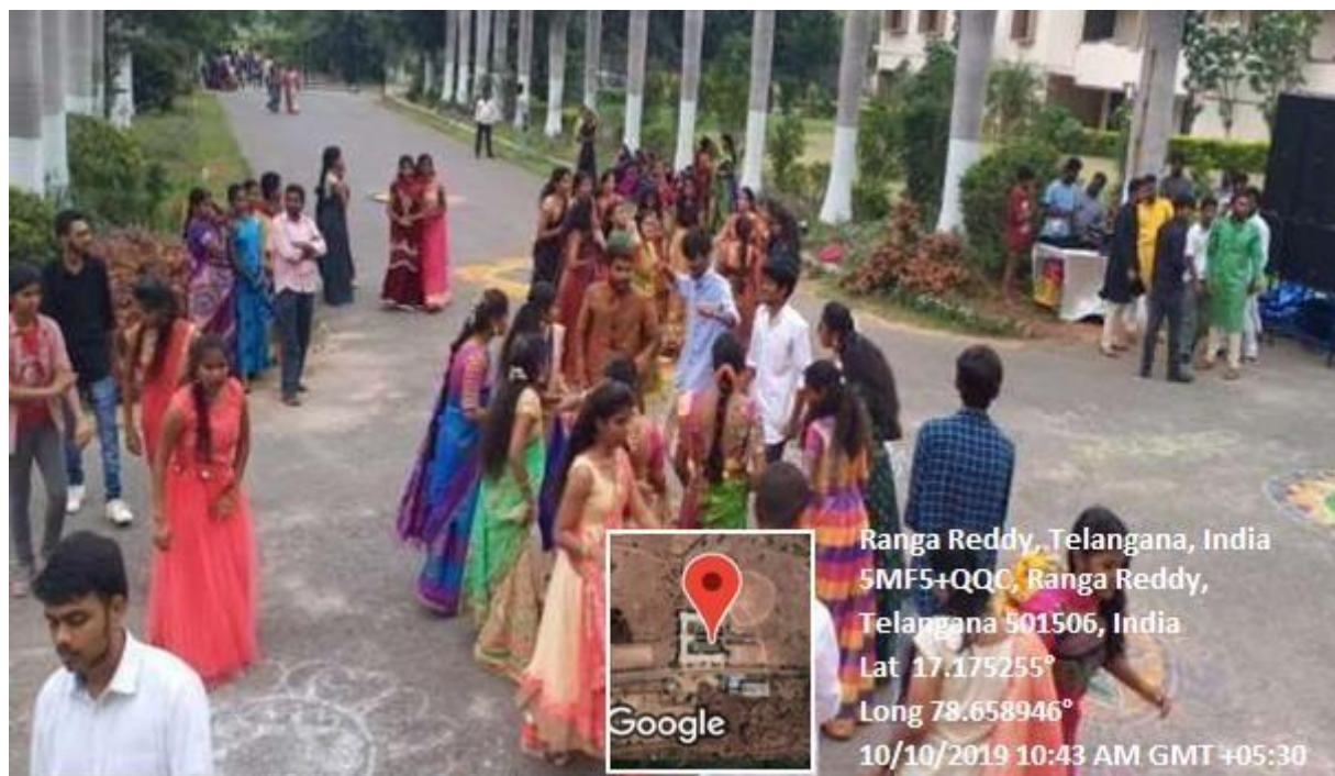
Students from all the departments performing Dandiya on the occasion of Bathukamma

The students and the staff encircled the Bathukammas and danced inunison, clapping andsinging to the music of liting folk songs.