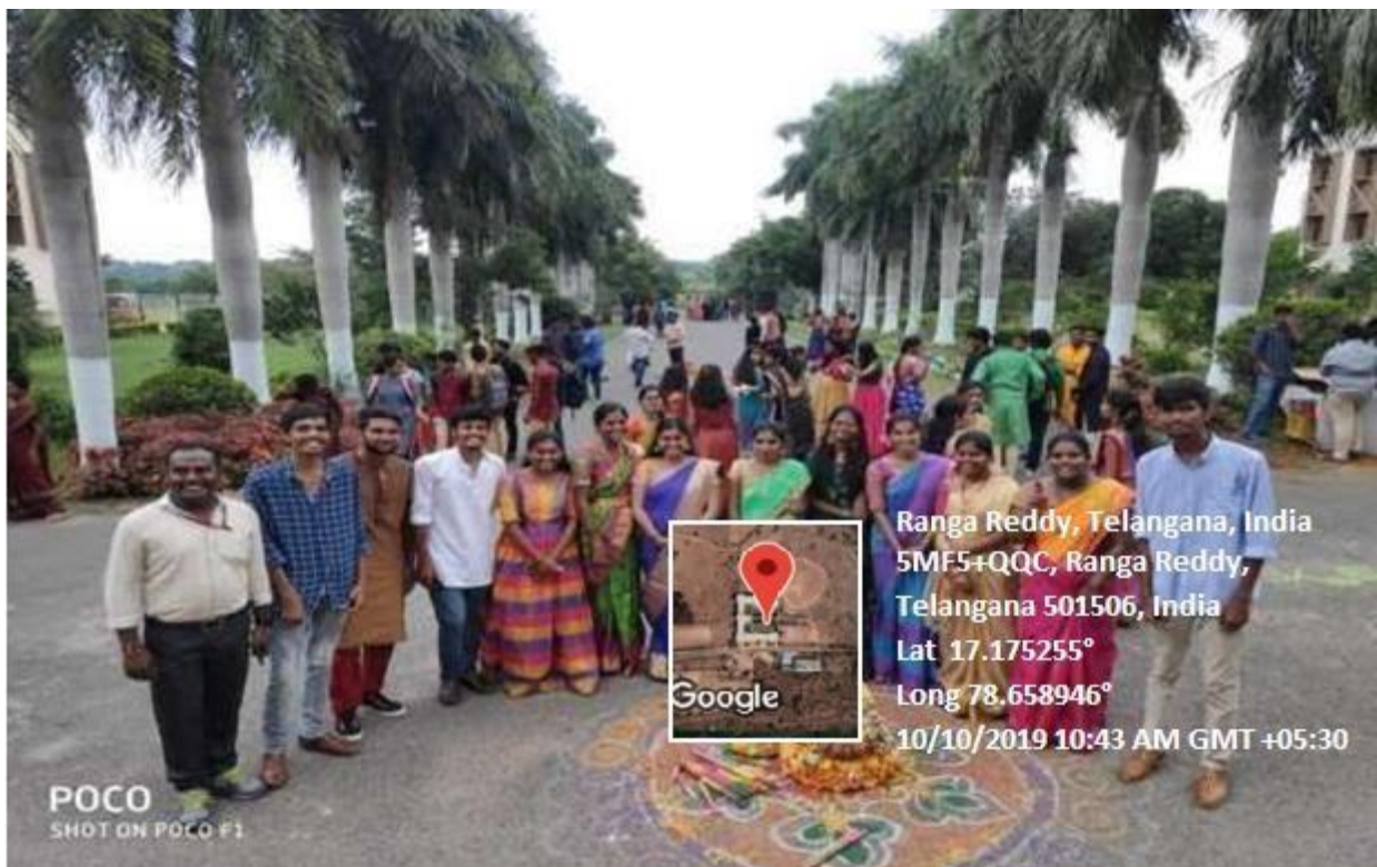
Students have a photo with faculty members on the occasion of Bathukamma