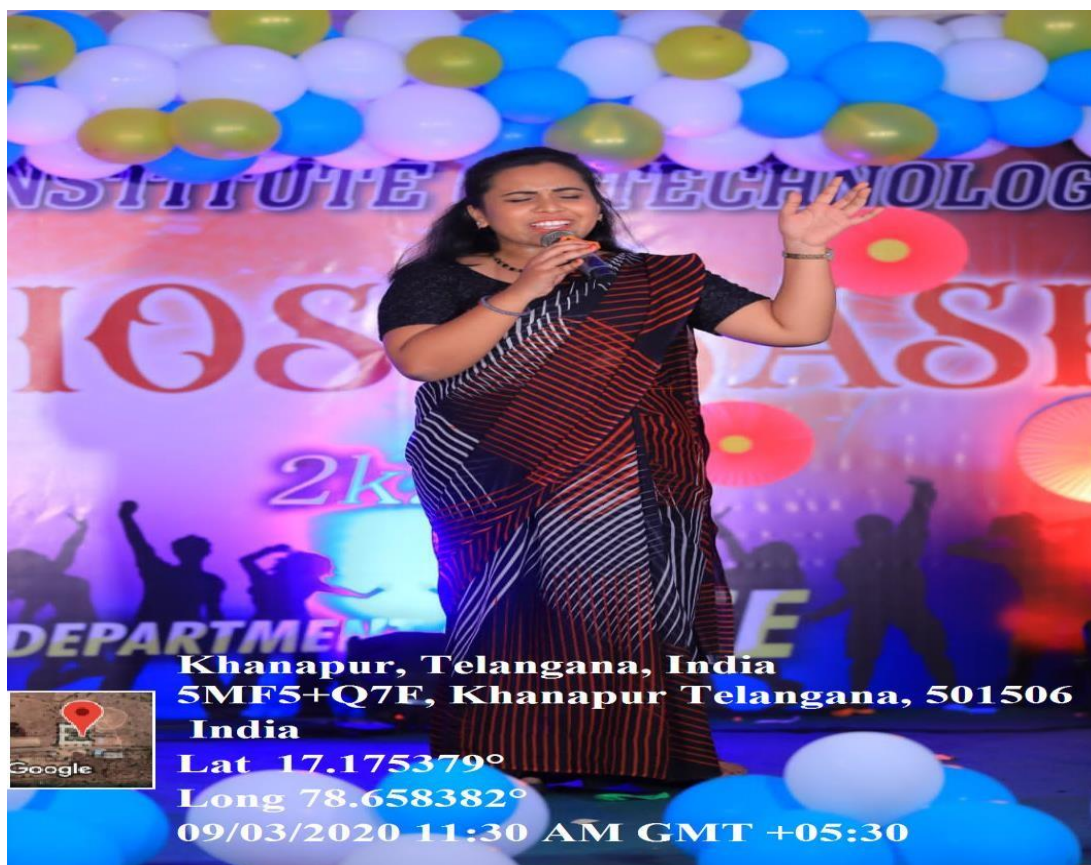
A student from ECE performing a Dance

The club provides a platform to students to showcase their talent in music, dance and other fine arts. It encourages managerial capabilities through event management and stage organization.