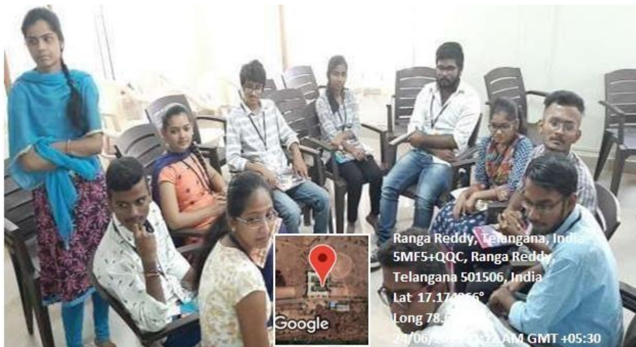
Students performing Drama and mono action

Drama clubs by the students on inculcating the values of past & learning from the great old freedom fighters. The most effective moments in the drama are those that appeal to basic and commonplace emotions--love of woman, love of home, love of country, love of right, anger, jealousy, revenge, ambition, lust, and treachery. In SNTI Drama club encourages the students to strive for a cleaner and healthier mind.