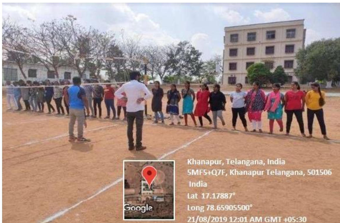
Students from girls are selected to play Kabbadi